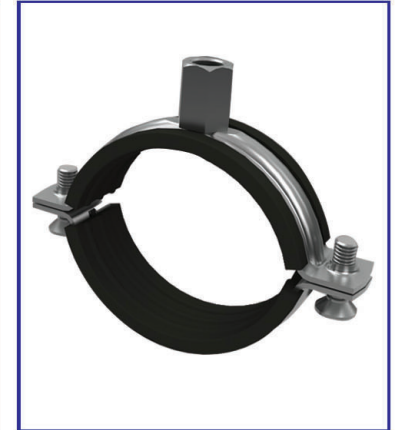
SELECTION TABLE (Table No: B-03-01)